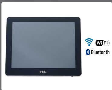
Built-in Wi-Fi and Bluetooth.