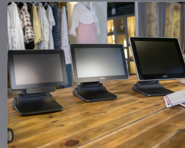
With same MB, it is easy integrating and setting AerPPC Lite & AerTab to comprehensive and flexible solutions.