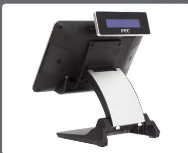
Integrated Customer Display