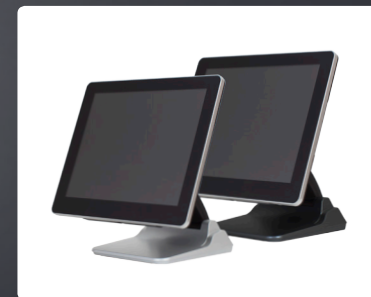
Dual-hinge stand in black and silver color.