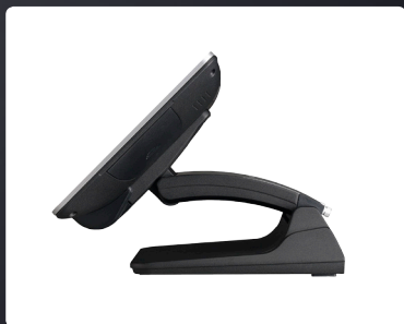
Tiny foot print, ultra slim profile, foldable dual-hinge stand for outstanding space saving.