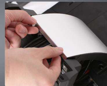
Efficient cable management in dual-hinge stand.