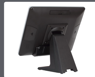
Standard base optional