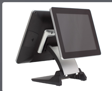
Integrated AerArm 12inch Display