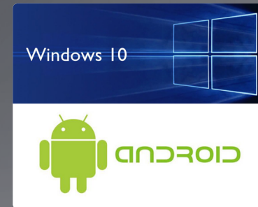
Cross OS Platform (Windows / Android).